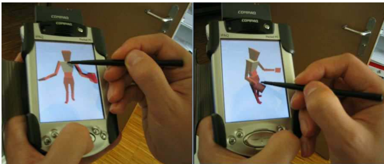
Figure 6. Character control on the PDA