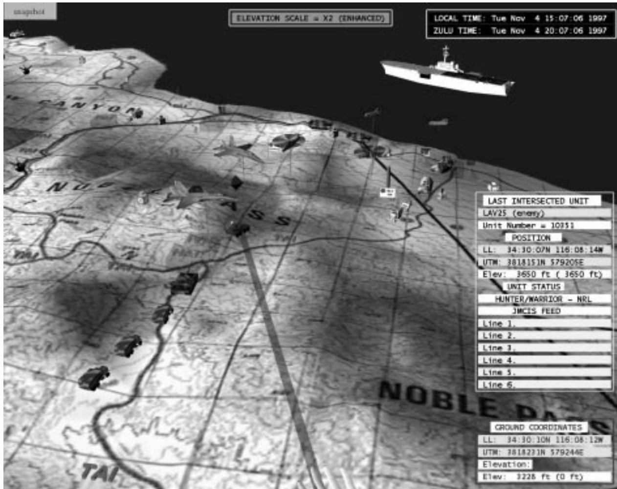
Figure 1: Screen shot from the Dragon battlefield visualization virtual environment.

Personnel at the Naval Research Laboratory's (NRL) Virtual Reality Lab have developed a VE for battlefield visualization, called Dragon (Figure 1) [3], which is implemented on a Responsive Workbench [9, 13]. The responsive workbench provides a natural metaphor for visualizing and interacting with three-dimensional computer-generated scenes using a familiar tabletop environment. Applications in which several users collaborate around a workspace, such as a table, are excellent candidates for the workbench. Researchers from NRL, collaboratively with researchers from Virginia Tech, are empirically studying the most important usability parameters of an effective VE user interface for Dragon.