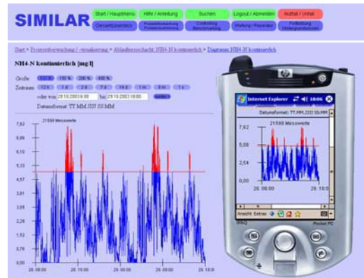
Figure 2: Process monitoring and visualization.

server approach if the browser is Java-enabled, otherwise the 3-D servlet method. We use two different HTML browsers on the Pocket PC: Access Netfront 3.0 (without Java) and Pocket Internet Explorer 2003 with the Insignia Jeode Java plug-in. With the server approach, about 1 fps can be achieved on the iPAQ. The framerate is independent of the model complexity. If the servlet method is used, the user has to click on navigation buttons to reload a new view of the model. The completion of such a request takes about 1.5 seconds. Note that the servlet approach has very low requirements on the client, only a simple HTML browser is needed.