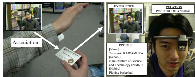
Figure 4: Associating experiences with a person

In the Nice2CU system, three types of equipment are essential: wearable equipment, the RFID card interface, and the magic mirror interface. The wearable equipment is composed of an RFID tag reader, a wearable camera, and a head-mounted display.