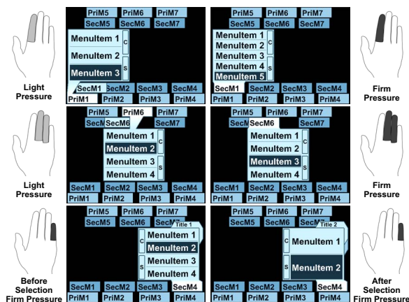
Figure 2: Sample screenshots and finger gestures used: a, top row: primary and secondary menus for the leftmost linear strip. b, middle row: primary and secondary menus for the middle dual-motion linear strip (middle two linear strips together). c, bottom row: indication of depth with tabs for secondary menu of the rightmost single linear strip.

menu items happens as in [1], using a combination of two adjacent fingers: the finger corresponding to the menu tree highlights menu items, and the adjacent finger contacts the lower half of the adjacent strip to select the item or the upper half of the adjacent strip to step back in the menu hierarchy. By using this pop-through technique, the number of menu trees that are directly accessible from the base state can be doubled from four to eight.