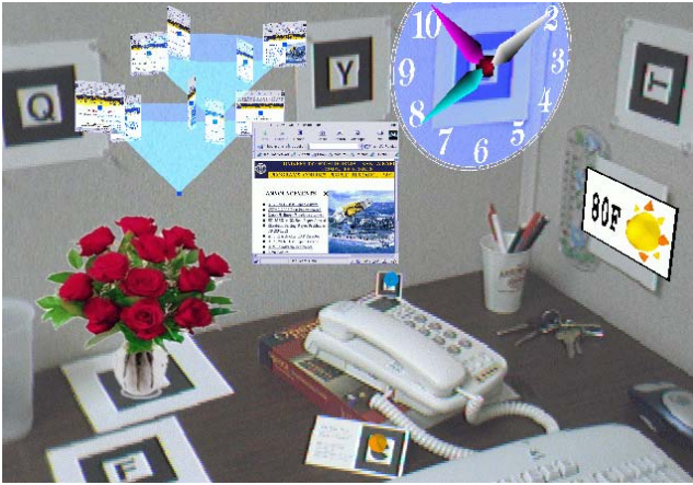
Figure 1. A typical ARWin desktop, as seen through a video see-through head-worn display (Sony LDI-A55 with Point Grey Firefly camera). Applications are (clockwise from right) weather report, tagged phone, business card, flowers, web browser, clock.