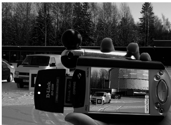
Figure 1. Fully equipped iPAQ with the test model (an outdoors AR demonstration).

Handheld displays provide an attractive way to present mobile augmented reality to the user. In particular, PDA devices are much easier to carry around than backpack PCs, and also nicer to handle than HMDs. For many applications a handheld display is even more useful than HMD, for instance it can be viewed by multiple users, and the screen can be frozen to study and discuss details of a certain view.