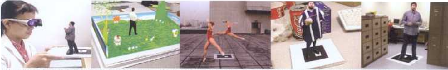
Figure 8. Examples of 3-D Live output. Live human actors can be captured in real time and superimposed realistically onto the scene.