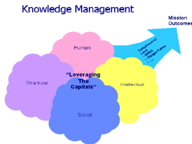
Figure 2. Leveraging KM with Balanced Scorecard

The dynamic mixing of human, intellectual, social and structural capital provides the fuel for creating and using knowledge. In this day and age when retention and recruitment are major concerns in both public and private industry, an organization’s success in leveraging its