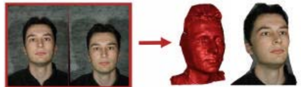
Figure 2: Input images and resulting 3-D shape

The performance of our system is shown on Figure 2.