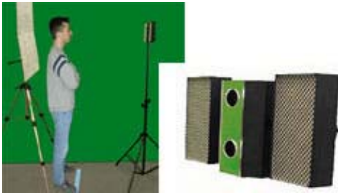
Figure 1: The 3-D shape acquisition system

Because we are working in 3-D, we overcome limitations due to viewpoint and lighting variations. Our 3-D acquisition system consists of two off the shelf, calibrated cameras, and a robust stereo processing, resulting in a dense, accurate 3-D representation, even in the presence of facial hair. The physical set-up of the system is shown on Figure 1 below.