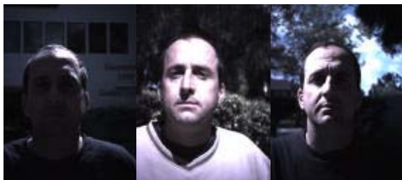
Figure 4: Outdoors experiment input images

We have also conducted a number of field experiments, indoors and outdoors, to experimentally validate the above results. We find that, indoors, the system should be useable under normal lighting conditions, even without the integrated lamps. Outdoors under bright sunlight, the illumination reaches over